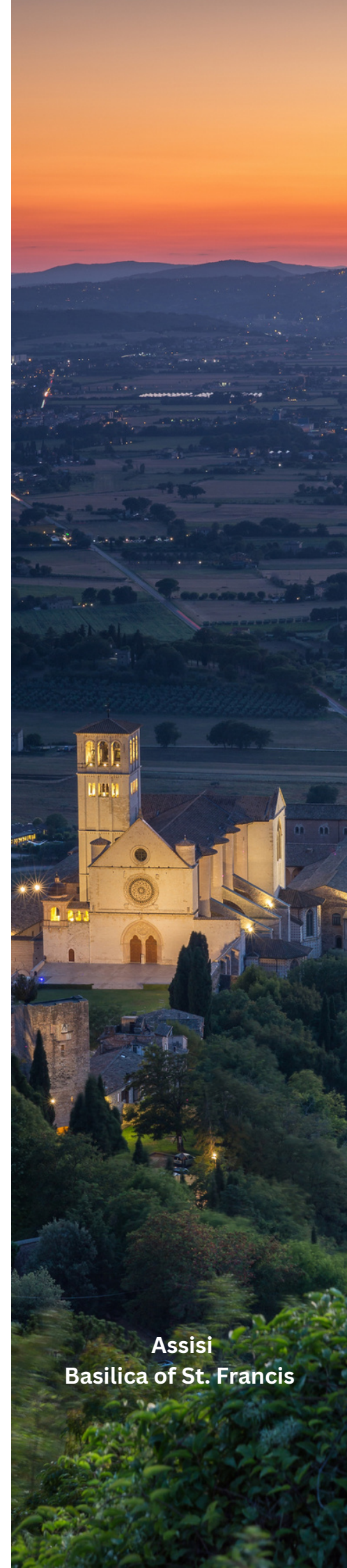
Assisi Basilica of St. Francis