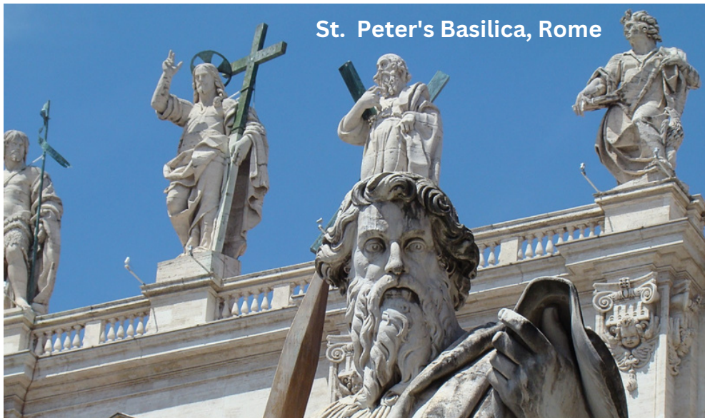
St. Peter's Basilica, Rome

Early morning transfer to Vatican Museums for a visit! After the Museum, we will continue visiting Saint Peter's Basilica . Free time for lunch. Afternoon visit to Ancient Rome , including the Colosseum (no entrance), Roman Forum , Temple of Julius Caesar , and Arch of Constantine .