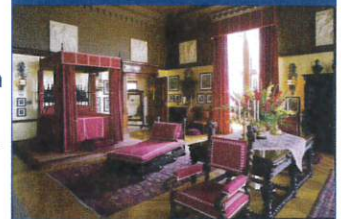
Grand Victorian architecture.