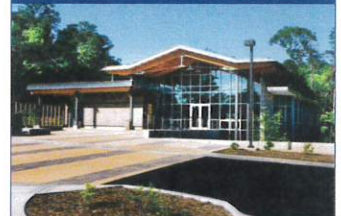
The Blue Ridge Parkway Visitor Center.