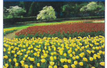
One of the Biltmore's many gardens.

$75 Due Upon Signing. *Price per person, based on double occupancy. Add $229 for single occupancy. Final Payment Due: 9/24/2025